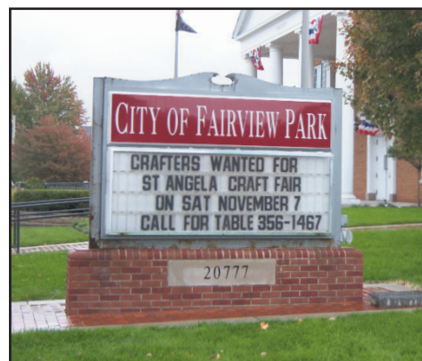
The marquee sign in front of Fairview Park City Hall is broken and needs to be replaced, city officials said.